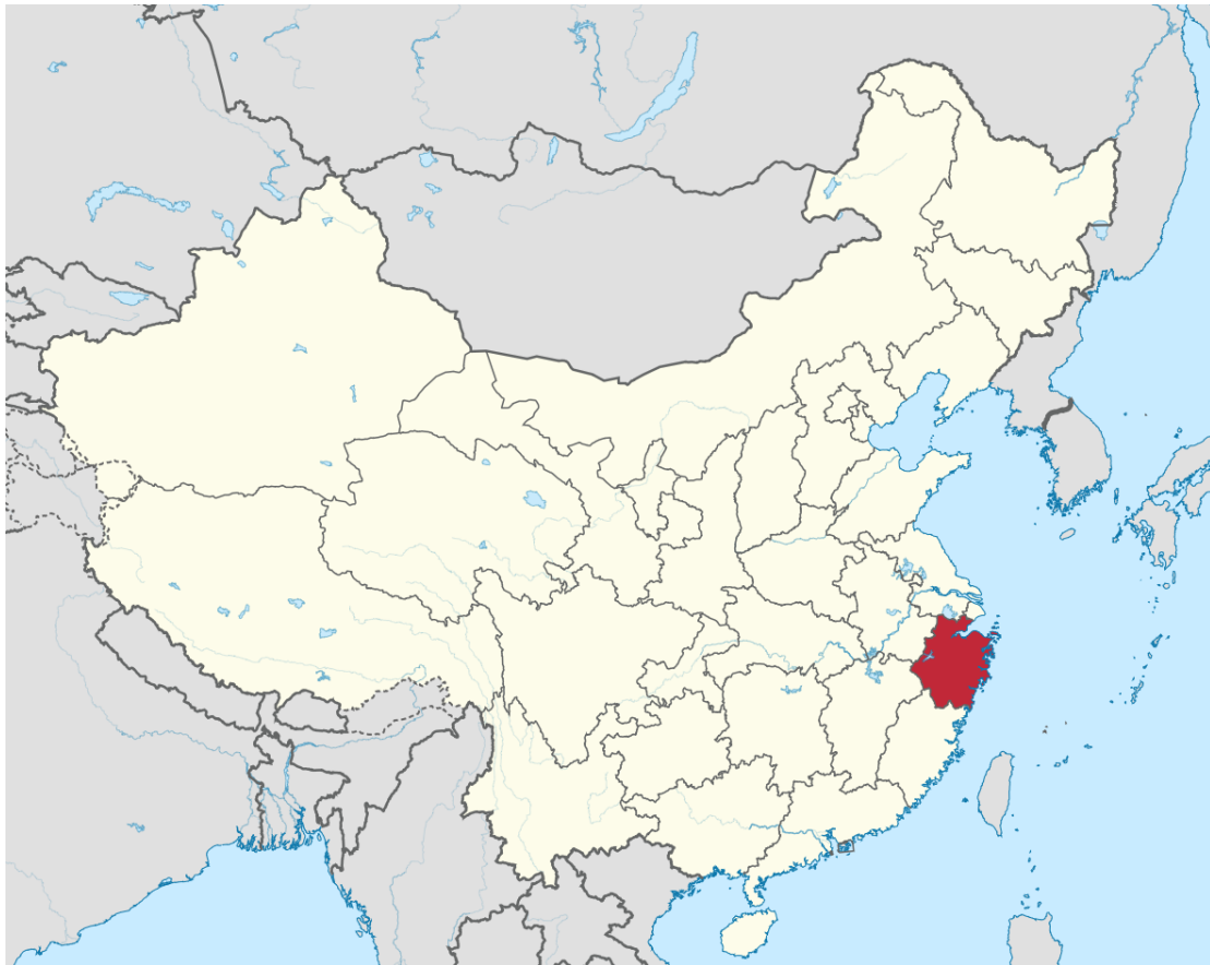
Zhejiang Province in China

In the updated collaboration Memorandum of Further Cooperation and Exchange between Zhejiang province and Zealand region, the Sino-Danish Innovation Park (Shangyu Hangzhou Bay) is also mentioned.